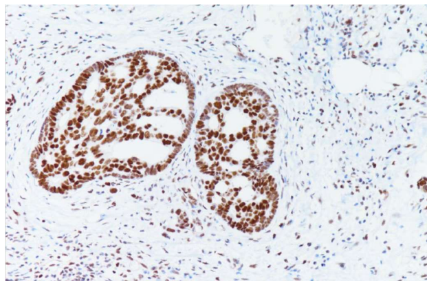
Figure 1 Human CRC stained with anti-MSH2 antibody.